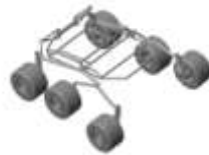
Figure1. Wheels using mars rover mechanism

The speed efficiency is increased with the help of mars rover mechanism which is able to run on terrains without resisting the speed. This mechanism makes use of six wheels each having a motor. The front and rear wheels also have single steering motors individually. This steering unit makes the machine to turn full 360 degrees round. The four steering wheels helps the rover to move across the curves and rocky planes enabling it to move smoothly over the terrains. The maximum angle it can offer is about 65 degrees. However researches are going on to increase its angle so that it can cross about more than 65 degree obstacle coming across its path. The most important thing when designing suspension is to look into the fact that the system should be able to change its position dramatically when crossing a rocky path.